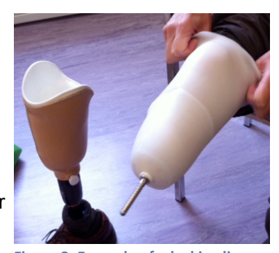
Figure 8: Example of a locking liner

Locking liner – this type of suspension involves a silicone or gel liner with a pin at the end. The pin locks into the socket of the prosthetic leg to keep it in place. A button on the side of the prosthesis releases the pin and allows the prosthesis to be removed.