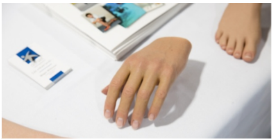
Figure 6: An example of high definition silicone prosthetic covers

they are not available as standard on the NHS, but can sometimes be prescribed in special circumstances. Usually this is because of the psychological effects of being an amputee.