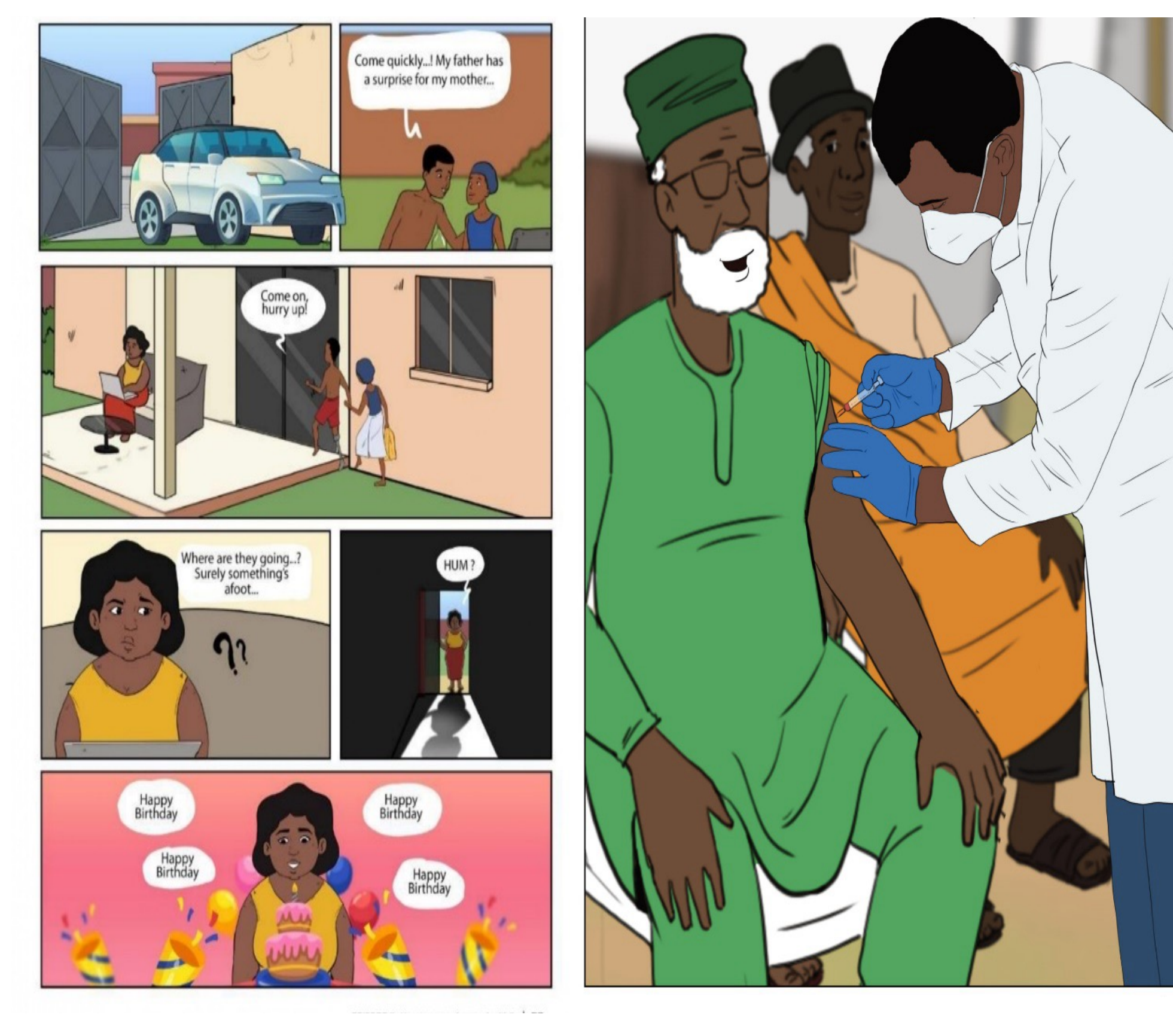
Figure 4: Some images from "Kolo and Meningitis" comic strip