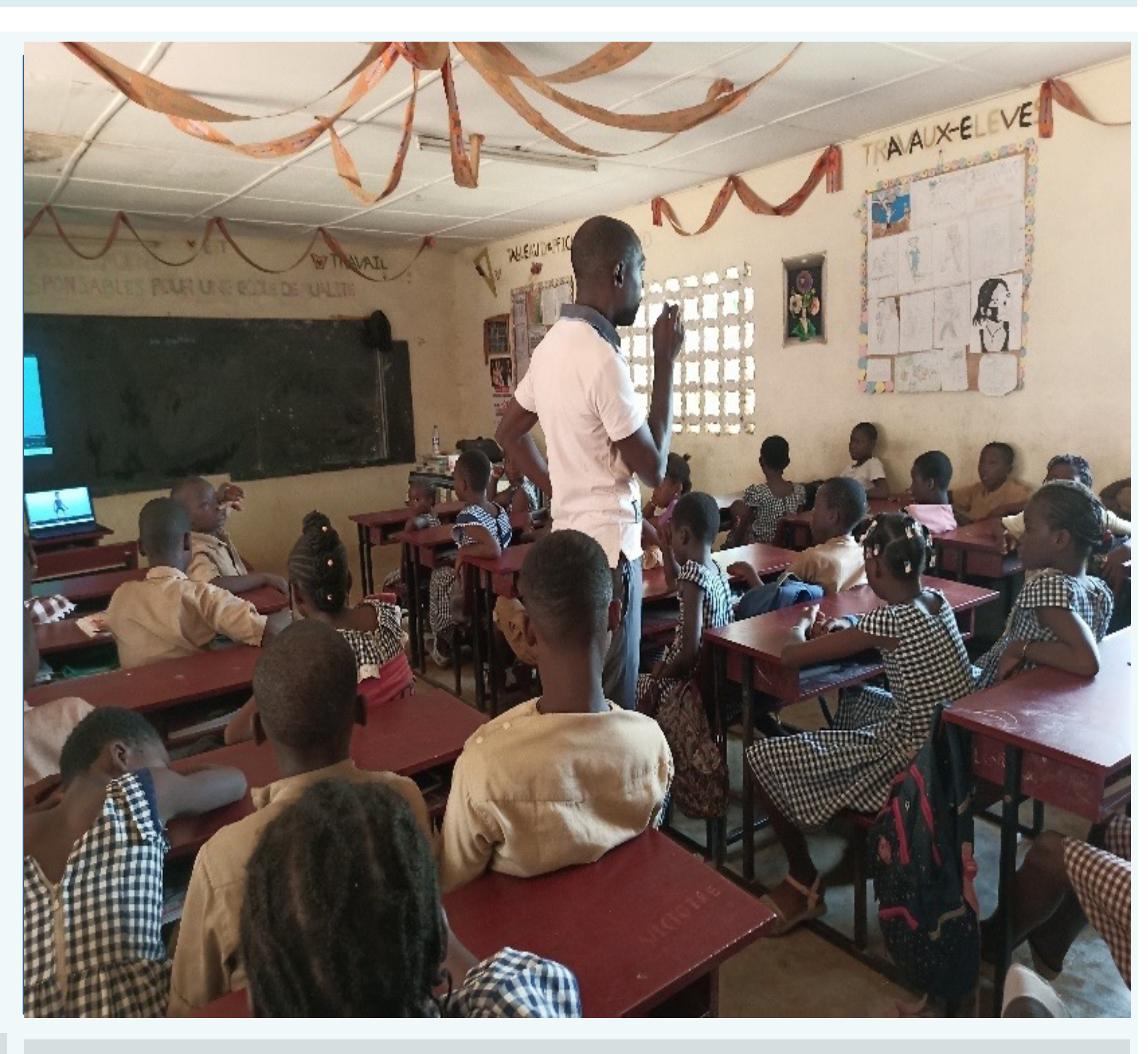
Figure 2: A photo from an awareness-raising session with school children